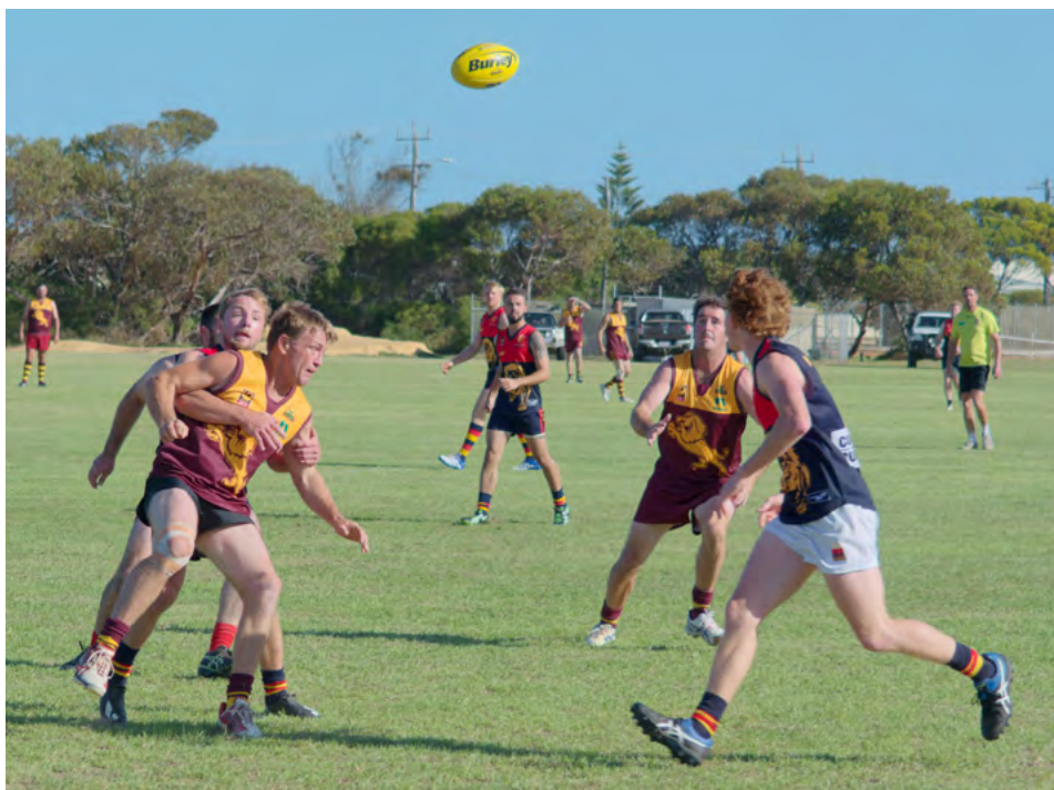
ABOVE: Action at the football.

Both Newdegate and Newtown-Condungup have shown interest in a return.