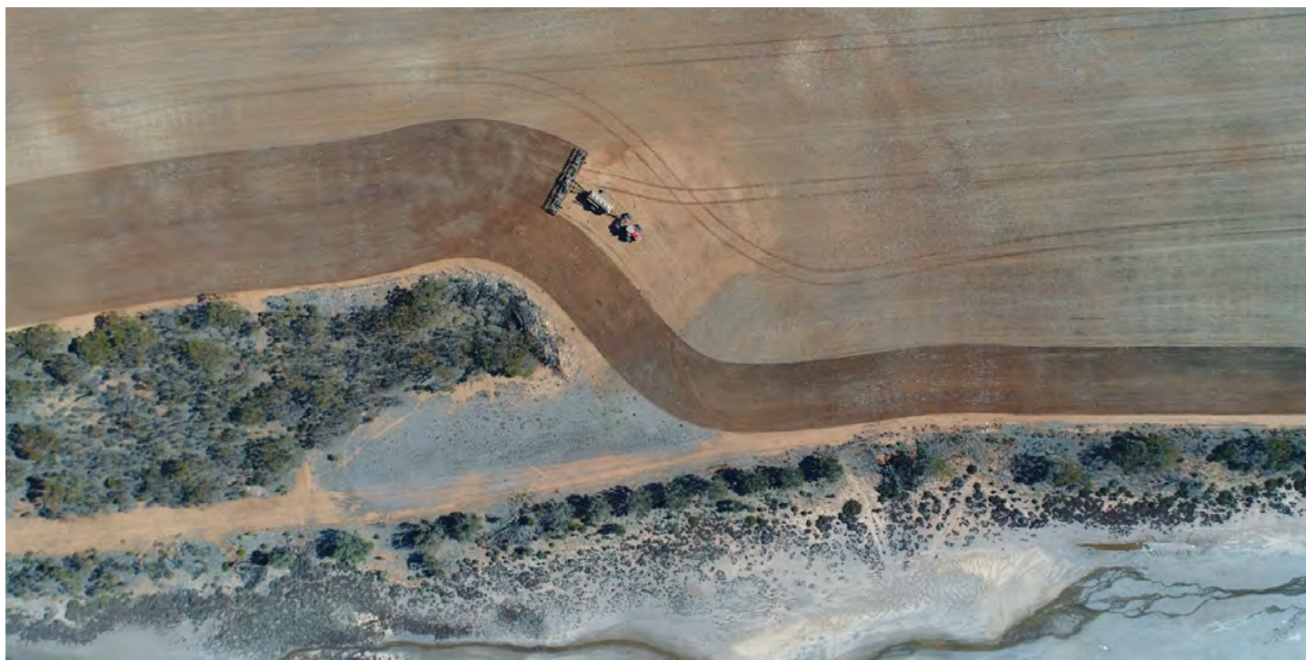
■ 'Seeding at Phillips River Farm'—Rain Kingla (Above and below).