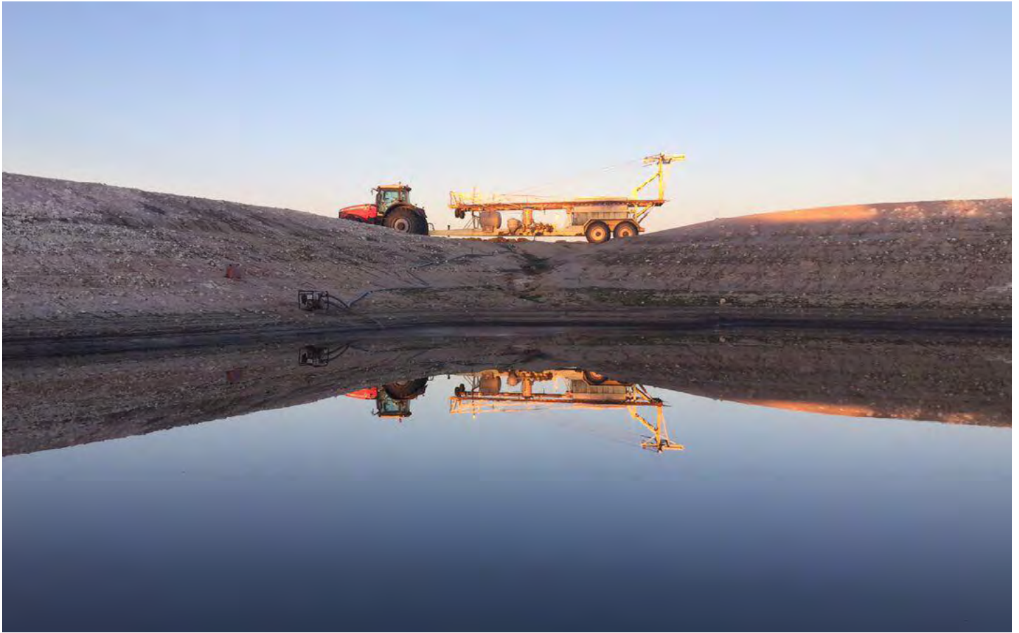
■ 'Mirror Image'—Ashley Price